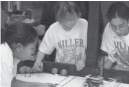
Above: Students from Miller Elementary completing the No Limits missions.