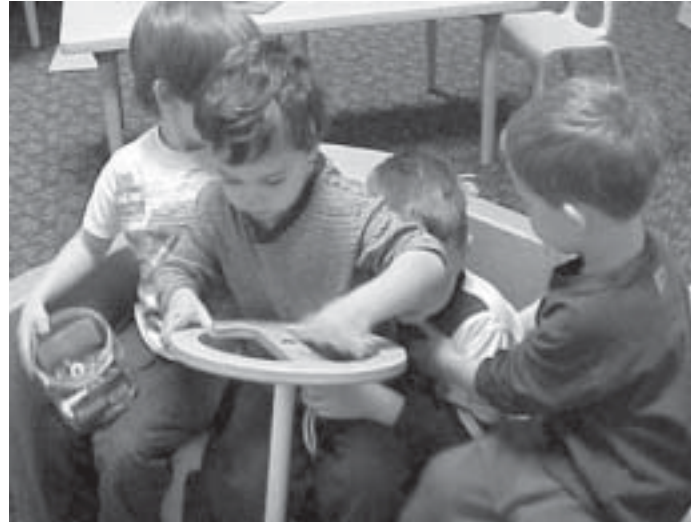
Right: RTI's partnership with the MUEEC allows children to learn first-hand about transportation concepts such as traffic safety, transporting goods and constructing roads and bridges.

Another component of the program is the MUEEC website, which includes detailed outlines and photo galleries of highlighted classroom projects from the past three years. These highlights include an investigation of the trucking industry and a study of barges on the Ohio River. The web component will also contain information on the upcoming workshops and institutes.