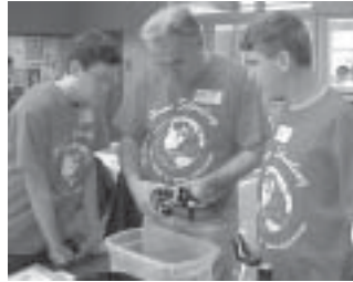
Above: Students constructing their LEGO robot prior to competition

Five area schools that are sponsored by RTI participated in the FIRST (For Inspiration and Recognition of Science and Technology) LEGO League (FLL) tournament Dec. 11, 2004, at the Caperton Center for Applied Technology in Parkersburg, W.Va.