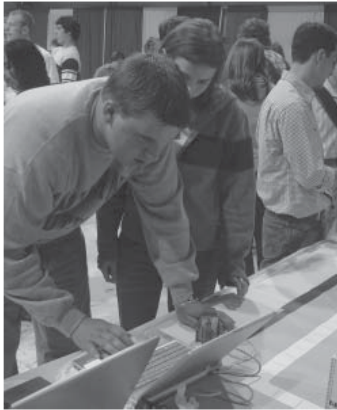
Above: A high school student investigates careers in GIS at RTI's information table at the 2004 College and Career Day.