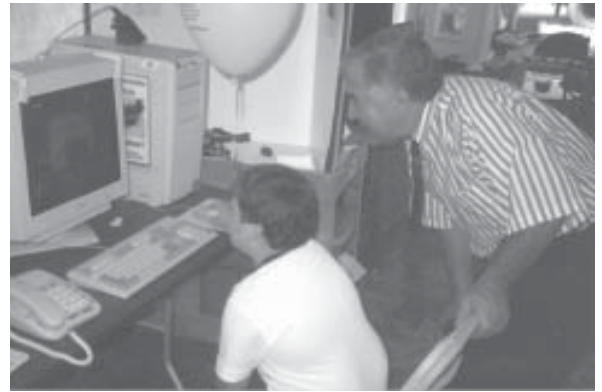
Above: Rep. Rahall watches as a guest "Teleoperates" a LEGO Robot at the RTI exhibit in Fairlea, W.Va.

Visitors to the exhibit also picked up information about RTI, Marshall University and its partner schools; BSC, Mountain State University, West Virginia University Institute of Technology and Southern West Virginia Community and Technical College.