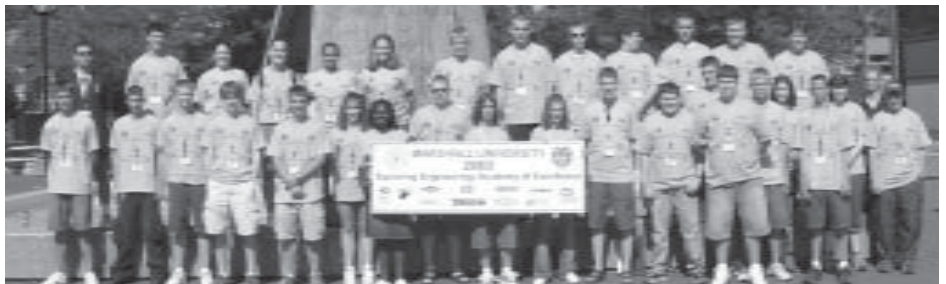
Above left: EEAE students listen as a representative from Hawk’s Nest State Park explains how engineers manipulate the New River using locks and dams. Above right: Thirty-one high school juniors from West Virginia, Ohio and Indiana comprised the EEAE 2003 camp.