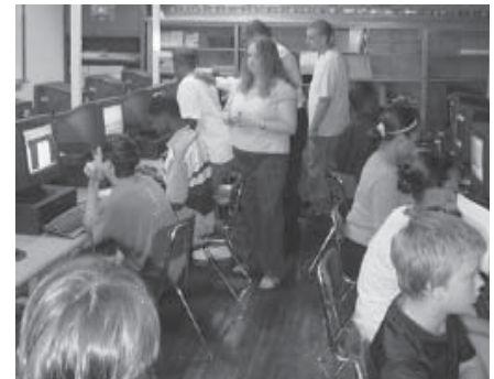
Above: Instructors at the DAFV workshop assist students with creating vehicles.

The workshop instructors guided students through hands-on training