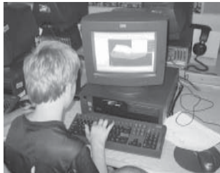
Above: A student uses computer-aided design and drafting software to create a model of a vehicle.

Each student was also introduced to computer-aided design and drafting software and used that software to create a future vehicle for pre-