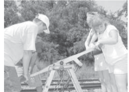
Above: Three Operation Lifesaver Rail Camp students operate a hand-car while learning about railroad safety.