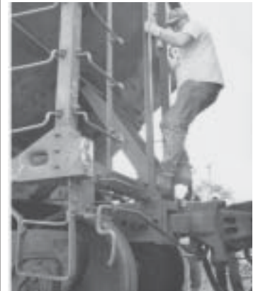
Above: Students learn to maneuver on RR cars. Left: RR Conductor graduates receive applause from family and friends.

The "Railroad Conductor Training Program," which is a five-week course in railroad safety, operating rules, signals, equipment and topics essential for success, graduated all 25 stu-