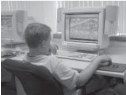
Above: A student learns to integrate data into GIS software at the EEAE 2002 summer workshop.