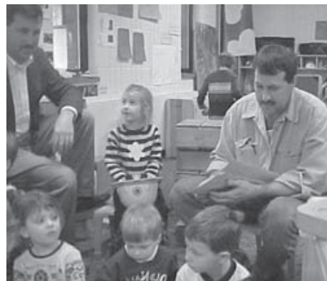
Above: Engineers and students at Marshall University's Child Development Academy discuss transportation during National Engineer's Week.

Lambs" program informed students about transportation through discussions and hands-on learning.