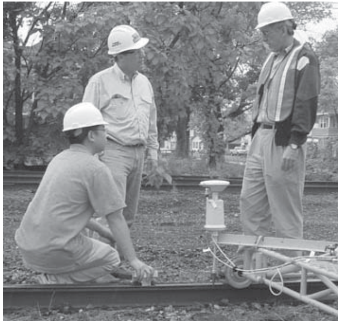
Left: Research associates from RTI prepare to examine the geological stability of a rockface located adjacent to a railroad track in rural Cabell County, W.Va.

The paper was also accepted for publication at the 2003 American Railway Engineering and Maintenance of Way Association meeting in Chicago.