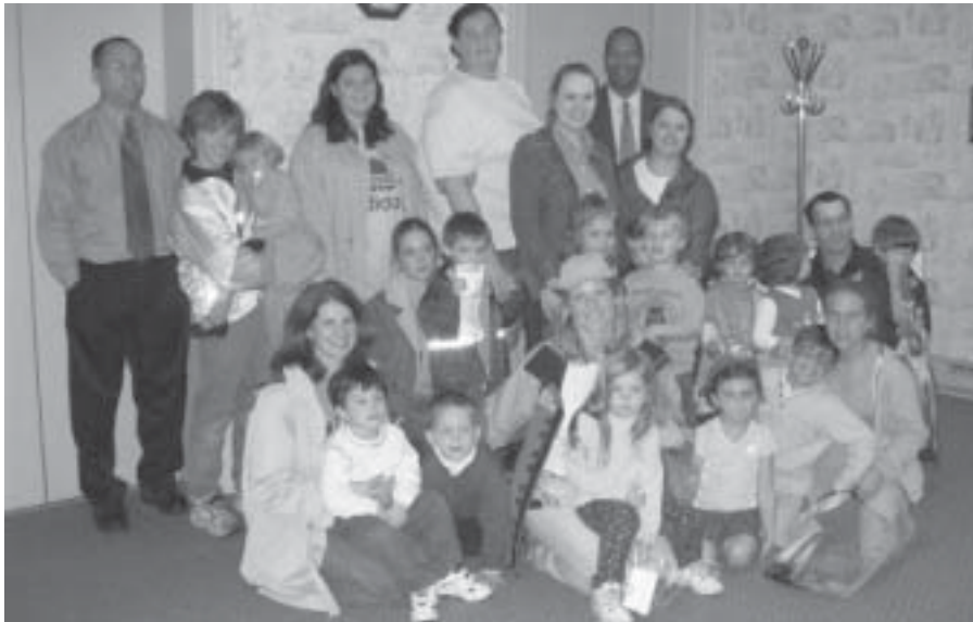
Above: Students from Marshall University's Early Education Center visit RTI to learn about LEGO Robotics, mapping technologies and transportation careers.