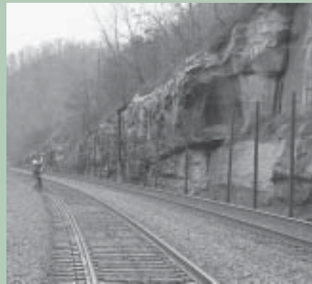
Above: Researchers examine a vertical rock slope near Crum, W.Va.

RTI's initial plan was to use several remote sensing technologies to determine the elevation and quantity of the unstable rock mass, the extent to which the rock fracture extends into the slope and if failure of