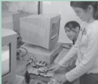
Above: Students at Culloden Elementary send science questions and Mars Red Rover challenges to students at Davis Creek Elementary via the Internet using LEGO Mars Red Rover software.

"We support the continuation of this project by RTI to train students in building and programming intelligent vehicles using LEGO Robotics and tele-operation in this rural school."