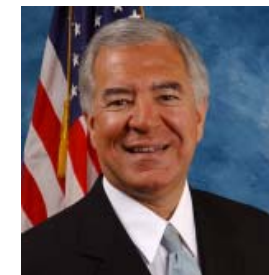
U.S. Rep. Nick J. Rahall, II