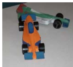
Above: CO 2 Racers were designed, created and tested by students.