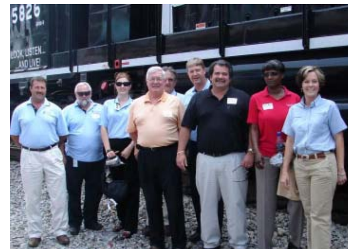
Above: West Virginia Operation Lifesaver volunteers presented rail grade crossing safety information to passengers on the Norfolk Southern Excursion Train.

The trip, which was made possible by Norfolk Southern, was an educational program to make the public aware of grade crossing safety. According to Norfolk