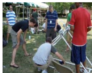
Above: Teams constructed trebuchets from PVC pipe, duct tape and other household supplies.

Monday morning started bright and early at 8 a.m. with an introduction to CAD/CAM design, which aided